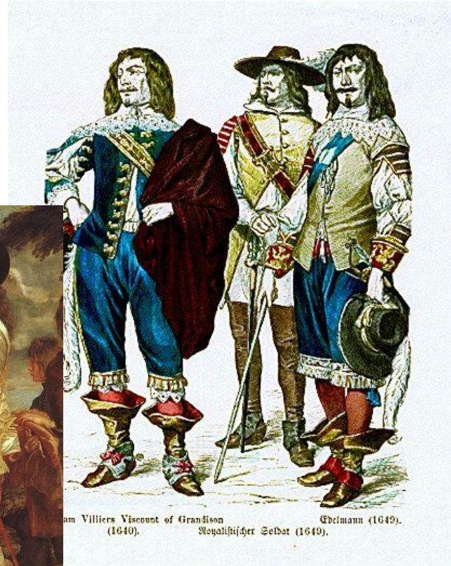
am Villiers Viscount of Grandison (1640). Chelmann (1649). Koyallicher Soldat (1649).